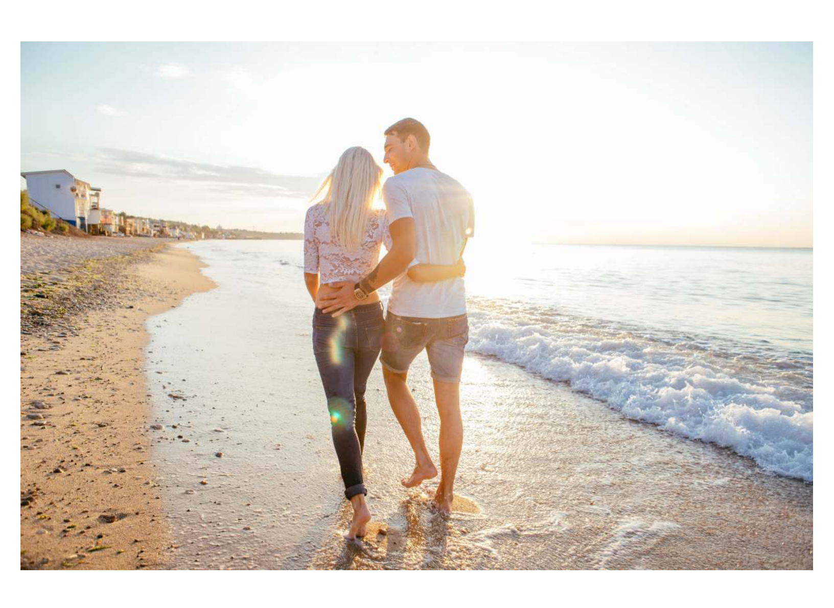
Start the Day Right